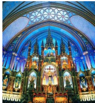
Basilica of Notre Dame

After breakfast in the hotel, you will travel to Quebec City for a scenic tour of this multi-cultural city of French and English flavors and stop to visit its basilica. Continue on to Montréal for a visit of the Basilica of Notre Dame