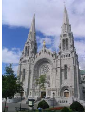
Shrine of St. Anne de Beaupre’

be shown the annals of devotion to St. Anne down through the centuries, and participate in the Stations of the Cross before an enjoyable dinner. In the evening, you will join in the Rosary and take part in the Candlelight Procession. Dinner and overnight stay at the Basilica Inn.