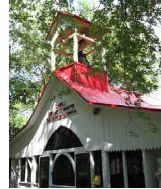
Martyrs and Kateri Chapel

After breakfast in the hotel, you’ll depart for Auriesville, NY, birthplace of Kateri Tekakwitha, stopping for a luncheon on the way. Mass will be celebrated at The National Shrine of the North American Martyrs, also known as the Shrine of Our Lady of Martyrs. This was dedicated to the Jesuit missionaries who were martyred at the Mohawk Indian village of Ossernenon between 1642 and 1646. In the late evening you will continue on the short ride to Albany for dinner and overnight.