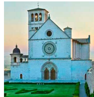
Basilica of St. Francis of Assisi

After breakfast in your hotel, you will depart for ASSISI , birthplace of St. Francis where Mass will be celebrated in the Basilica by the tomb of the beloved Saint. This basilica was nearly destroyed when its roof collapsed during the horrendous earthquake of 1997. You will be shown magnificent frescos which have now been almost completely restored. Enjoy a walking tour of a mystical city atop the green slopes of Mout Subasio and surrounded by ancient walls. Lunch in a typical restaurant before a visit of the church of St. Mary of the Angels. Continue on to ROME . Dinner and overnight stay in your hotel.